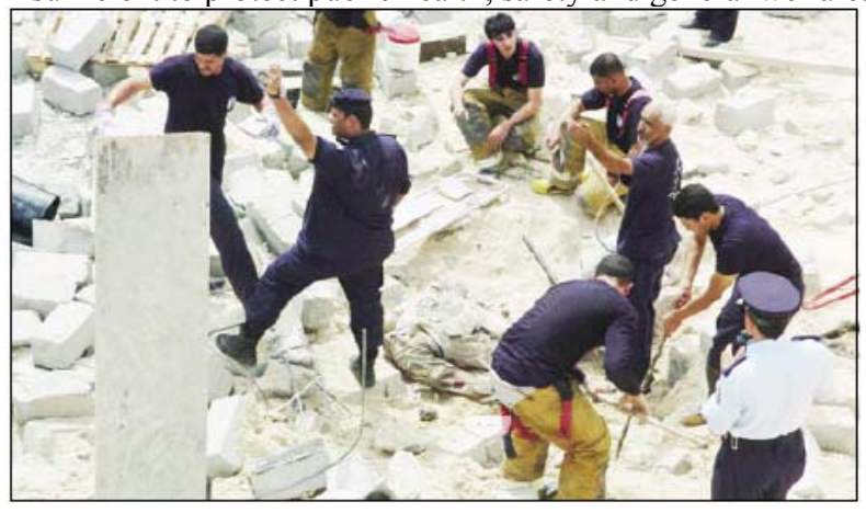
Fig. 1: Killing of two construction workers and two seriously injured in basement collapse under construction in Desma town in May 7, 2006

(AL-Sherhan, 2006). The consequences of the accidents caused death of two worker and two injured one of them seriously injured. In addition, the accident causes huge financial loss. Reinforce concrete structures should design and construct by approved standards and qualified contractor. The problem in Kuwait is that there are no solid regulation and enforcement mechanism that can be enforced by building official to prevent these incidences. This leads to the conclusion that current Building Regulations in Kuwait are insufficient to protect public health, safety and general welfare.