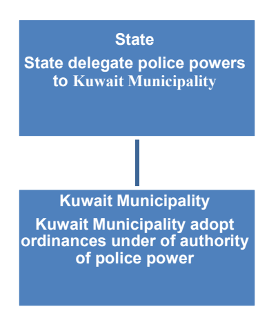
Fig.2: Building Control Police Powers

Article no. 19 from Kuwait Municipality Law shows that Municipality responsibilities to the work for the growth and advancement of building construction and public health, article no. 20 to organize building permit, and article no. 34 to the development of rules and principles of building construction.